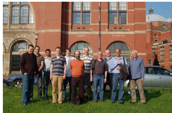
Delegates posing outside the University of Birmingham

Amr Said Deaf : Palynostratigraphy, palynofacies analysis and depositional environments of clastic lower Cretaceous sediments from the northern Western Desert, Egypt