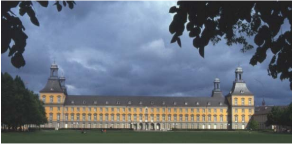
The congress venue at the University of Bonn's Main Building